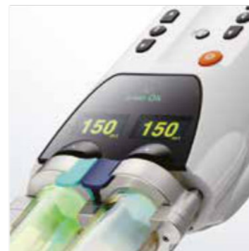
Organic EL display shows syringe remaining volume.