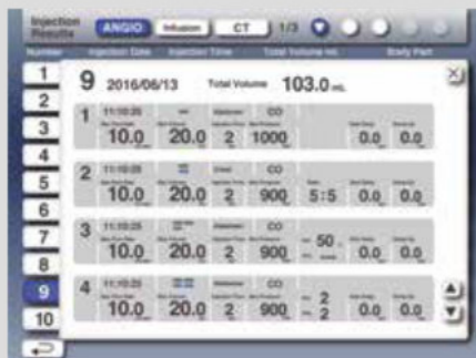
Injection Results screen shows injected volume in chronological order.