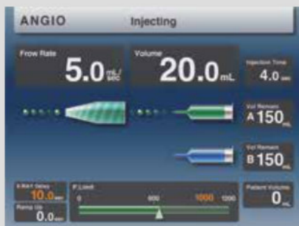
The GUI includes all necessary data on one screen image.