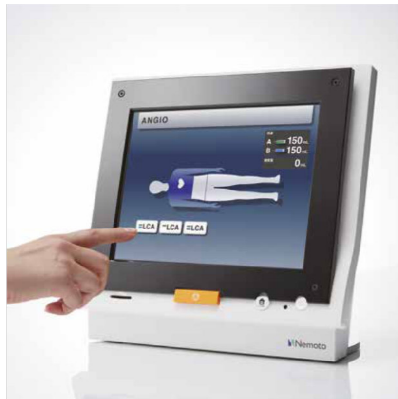
Console with touchscreen operation. Color changes based on mode of operation.