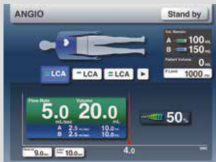
Setup screen to support quick and accurate input.

Vision friendly colors and sizes chosen as another safety feature of this new injector.